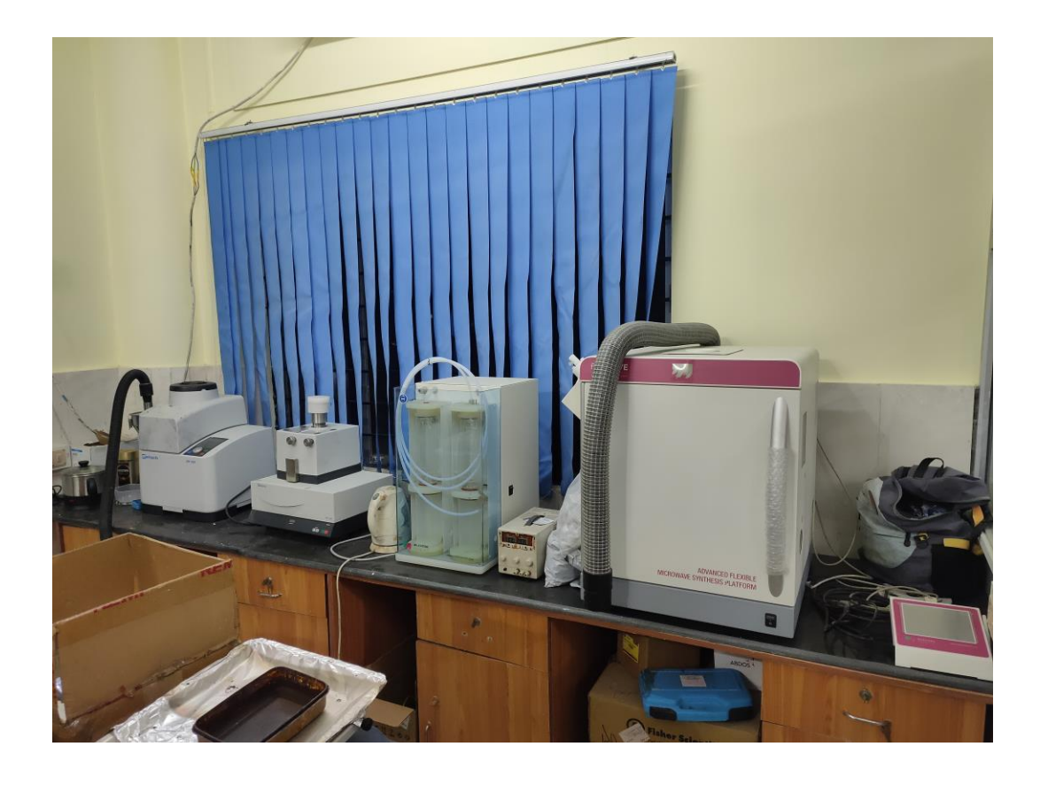
Laboratory II (Photograph)